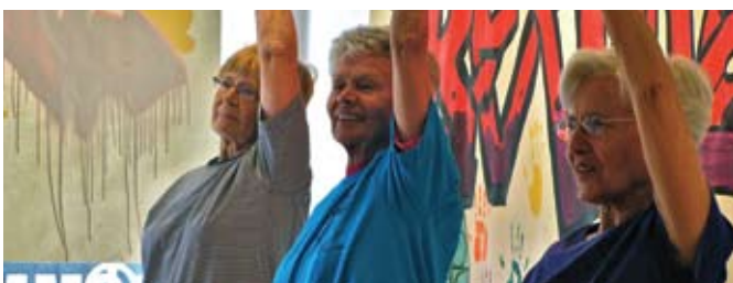
Seniors from MIMM Dance group in the Arts Etobicoke Gallery

Exploring Creativity in Depth – gallery workshops led by The Milkweed Collective in art appreciation, drawing & writing, ages 9-12