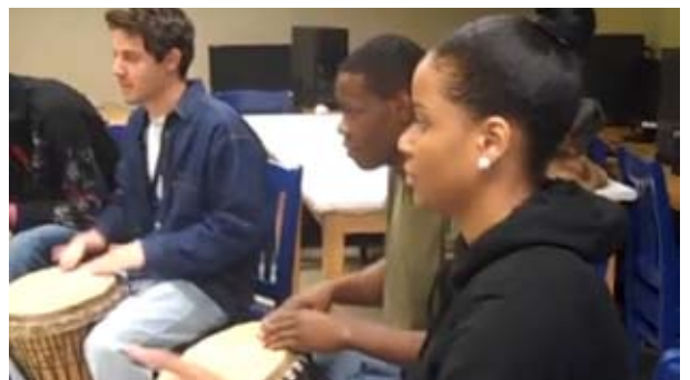
Sharing the rhythm in an African Drumming workshop at Youth Without Shelter