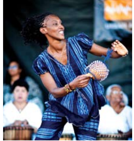
performance at the 6th annual urbanNOISE Festival at the Albion Library