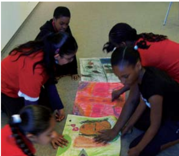
School children participate in the Exploring Creativity in Depth workshops