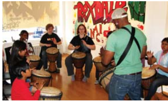
Free African drumming workshops for youth