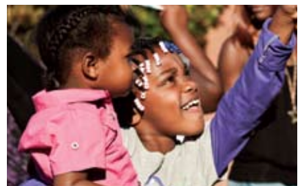
North Etobicoke community members take in 6th annual urbanNOISE Festival